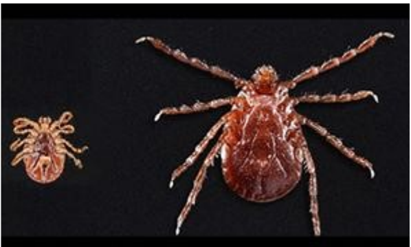
Left: Asian Longhorned Tick Nymph and Adult Female, top view. Right: Asian Longhorned Tick Nymph and adult female, underside.